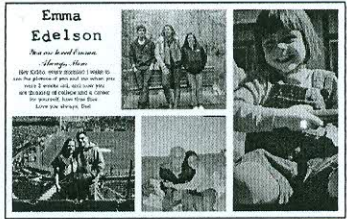
1/2 page ad: approximately 8.33" x 5.25"